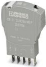
Electronic device circuit breaker, 1-pos., active current limitation, 1 N/O contact, plug for base element.

Please be informed that the data shown in this PDF Document is generated from our Online Catalog. Please find the complete data in the user's documentation. Our General Terms of Use for Downloads are valid ( http://phoenixcontact.com/download )