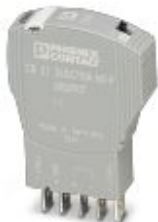
Electronic device circuit breaker, 1-pos., active current limitation, 1 N/O contact, plug for base element.

Please be informed that the data shown in this PDF Document is generated from our Online Catalog. Please find the complete data in the user's documentation. Our General Terms of Use for Downloads are valid ( http://phoenixcontact.com/download )