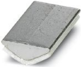
Insertion profile, color: silver

Please be informed that the data shown in this PDF Document is generated from our Online Catalog. Please find the complete data in the user's documentation. Our General Terms of Use for Downloads are valid ( http://phoenixcontact.com/download )