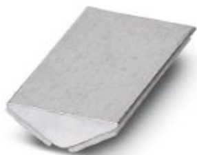
Insertion profile, color: silver

Please be informed that the data shown in this PDF Document is generated from our Online Catalog. Please find the complete data in the user's documentation. Our General Terms of Use for Downloads are valid ( http://phoenixcontact.com/download )