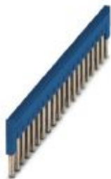
Plug-in bridge, pitch: 4.2 mm, number of positions: 20, color: blue

Please be informed that the data shown in this PDF Document is generated from our Online Catalog. Please find the complete data in the user's documentation. Our General Terms of Use for Downloads are valid ( http://phoenixcontact.com/download )