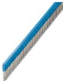
Plug-in bridge, pitch: 5.2 mm, number of positions: 50, color: blue

Please be informed that the data shown in this PDF Document is generated from our Online Catalog. Please find the complete data in the user's documentation. Our General Terms of Use for Downloads are valid ( http://phoenixcontact.com/download )