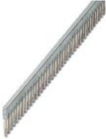
Plug-in bridge, pitch: 5.2 mm, number of positions: 50, color: gray

Please be informed that the data shown in this PDF Document is generated from our Online Catalog. Please find the complete data in the user's documentation. Our General Terms of Use for Downloads are valid ( http://phoenixcontact.com/download )