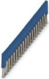
Plug-in bridge, pitch: 6.2 mm, width: 122.3 mm, number of positions: 20, color: blue

Please be informed that the data shown in this PDF Document is generated from our Online Catalog. Please find the complete data in the user's documentation. Our General Terms of Use for Downloads are valid ( http://phoenixcontact.com/download )