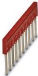
Plug-in bridge, pitch: 6.2 mm, number of positions: 10, color: red

Please be informed that the data shown in this PDF Document is generated from our Online Catalog. Please find the complete data in the user's documentation. Our General Terms of Use for Downloads are valid ( http://phoenixcontact.com/download )