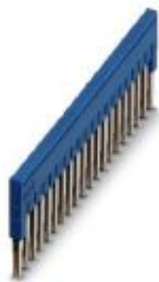
Plug-in bridge, pitch: 5.2 mm, number of positions: 20, color: blue

Please be informed that the data shown in this PDF Document is generated from our Online Catalog. Please find the complete data in the user's documentation. Our General Terms of Use for Downloads are valid ( http://phoenixcontact.com/download )