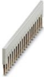
Plug-in bridge, pitch: 5.2 mm, number of positions: 20, color: gray

Please be informed that the data shown in this PDF Document is generated from our Online Catalog. Please find the complete data in the user's documentation. Our General Terms of Use for Downloads are valid ( http://phoenixcontact.com/download )