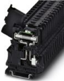
Lever-type fuse terminal block, black, for 6.3 x 32 mm G fuse inserts, with LED for 24 V DC

Please be informed that the data shown in this PDF Document is generated from our Online Catalog. Please find the complete data in the user's documentation. Our General Terms of Use for Downloads are valid ( http://phoenixcontact.com/download )