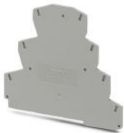
End cover, length: 99.5 mm, width: 2.2 mm, height: 88 mm, color: gray

Please be informed that the data shown in this PDF Document is generated from our Online Catalog. Please find the complete data in the user's documentation. Our General Terms of Use for Downloads are valid ( http://phoenixcontact.com/download )