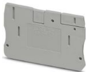
End cover, length: 57.7 mm, width: 2.2 mm, height: 36 mm, color: gray

Please be informed that the data shown in this PDF Document is generated from our Online Catalog. Please find the complete data in the user's documentation. Our General Terms of Use for Downloads are valid ( http://phoenixcontact.com/download )