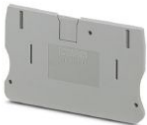
End cover, length: 67.7 mm, width: 2.2 mm, height: 42.6 mm, color: gray

Please be informed that the data shown in this PDF Document is generated from our Online Catalog. Please find the complete data in the user's documentation. Our General Terms of Use for Downloads are valid ( http://phoenixcontact.com/download )