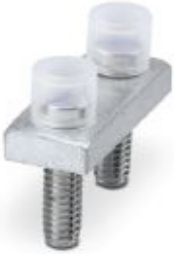
Fixed bridge, pitch: 20 mm, number of positions: 2, color: silver

Please be informed that the data shown in this PDF Document is generated from our Online Catalog. Please find the complete data in the user's documentation. Our General Terms of Use for Downloads are valid ( http://phoenixcontact.com/download )