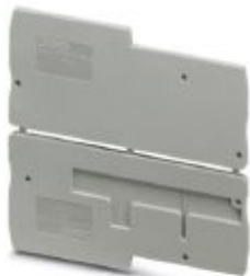
End cover, length: 74.4 mm, width: 2.2 mm, height: 33.8 mm, color: gray

Please be informed that the data shown in this PDF Document is generated from our Online Catalog. Please find the complete data in the user's documentation. Our General Terms of Use for Downloads are valid ( http://phoenixcontact.com/download )