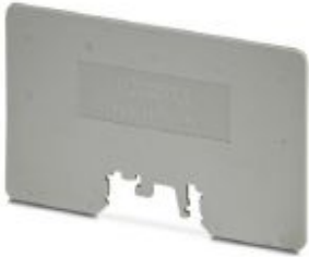
Partition plate, length: 110 mm, width: 2 mm, height: 69 mm, color: gray

Please be informed that the data shown in this PDF Document is generated from our Online Catalog. Please find the complete data in the user's documentation. Our General Terms of Use for Downloads are valid ( http://phoenixcontact.com/download )