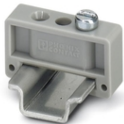
End clamp, width: 6.2 mm, color: gray

Please be informed that the data shown in this PDF Document is generated from our Online Catalog. Please find the complete data in the user's documentation. Our General Terms of Use for Downloads are valid ( http://phoenixcontact.com/download )