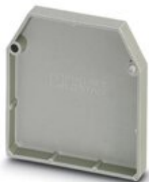
Separating plate, length: 50 mm, width: 7.5 mm, height: 52 mm, color: gray

Please be informed that the data shown in this PDF Document is generated from our Online Catalog. Please find the complete data in the user's documentation. Our General Terms of Use for Downloads are valid ( http://phoenixcontact.com/download )