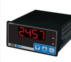
S311D Frequency / digital input indicators - totalizers pg. 124