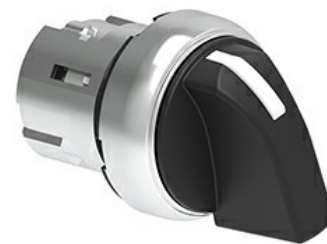
Selector switch actuators lever - 2 position LPSS12