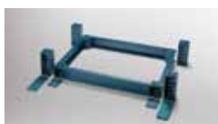
Universal plinth EUZE, see page 104