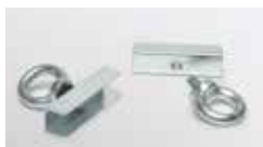
Eyebolts, see page 105