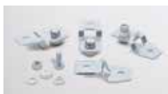
Wall-mounting brackets, see page 105