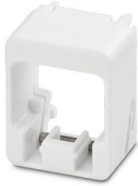
Plug Guard Security Frame

Please be informed that the data shown in this PDF document is generated from our online catalog. Please find the complete data in the user documentation. Our general terms of use for downloads are valid.