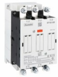
Power contactor BF160