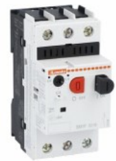
Motor protection circuit breaker SM1P