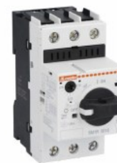
Motor protection circuit breaker SM1R