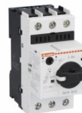
Motor protection circuit breaker SM1R