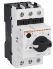
Motor protection circuit breaker SM1R