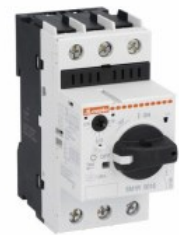
Motor protection circuit breaker SM1R