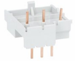
Rigid SM1 breaker-contactor connections SM1X Rigid SM1R breaker - BG contactor connections. SM1R...