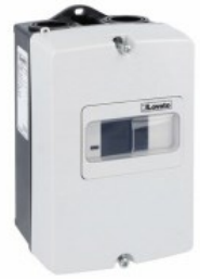
Surface mount enclosures IP65 (4X) for SM1P SM1Z Surface mount enclosures IP65 (4X) for SM1P SM1P...