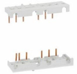
3P Rigid connecting kits for BF09...BF25 BFX3101