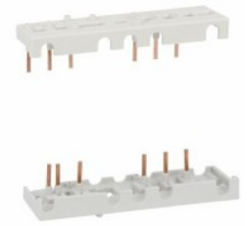
3P Rigid connecting kits for BF09...BF25 BFX3102