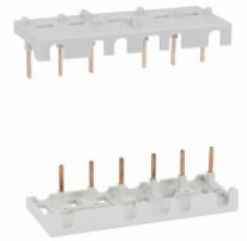
3P Rigid connecting kits for BF26...BF38 BFX3201