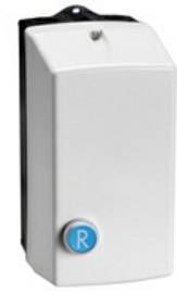
Empty enclosures M2RA