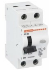
Residual current circuit breaker with overcurrent protection (RCBO) P1 RB 1P+N 2 IEC