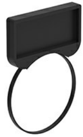
Label holder for engraved plastic LPX AU109 label LPXAU100