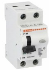
Residual current circuit breaker with overcurrent protection (RCBO) P1 RB 1P+N 2 IEC