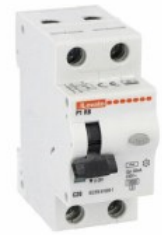
Residual current circuit breaker with overcurrent protection (RCBO) P1 RB 1P+N 2 IEC