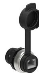
RJ45 interface, Ethernet connection type LPCD0 Cat.5E