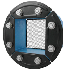
R 150 GALV