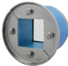
R 100 AISI 316